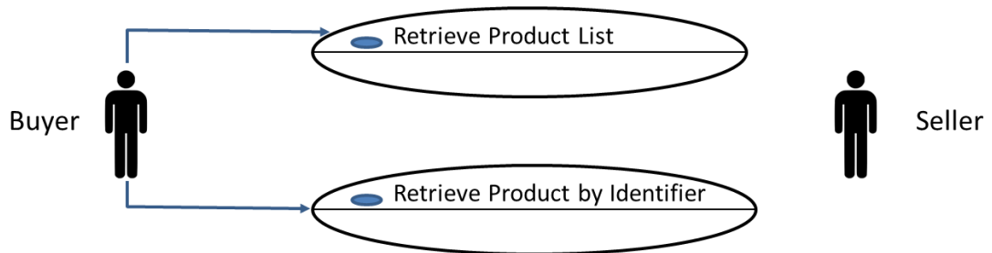
Figure 1 - Product Inventory Retrieval Use Cases

This section defines the Use Cases that support the retrieval of Product Inventory by a Buyer from a Seller’s Inventory Management System.